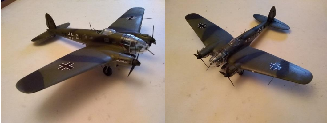
Chuck Converse built this 1/72 Heinkel 111 from Italeri.