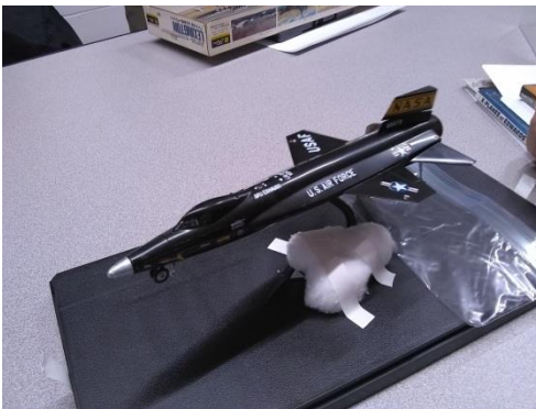
Bob Fiero brought in this 1/72 X-15 from Revell.