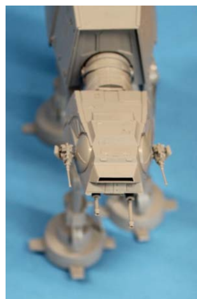
Icie Cook's latest "work in progress" is this nice 1/144 th Bandai Star Wars AT-AT