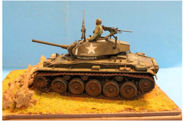
Keith Touchette's 1/35 th AFV Club M24 Chaffee with Fruil tracks and Blast Models storage