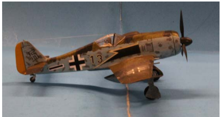
Chuck Converse's 1/72 nd Hasegawa FW-190A in the markings of "Pips" Priller on D-Day.