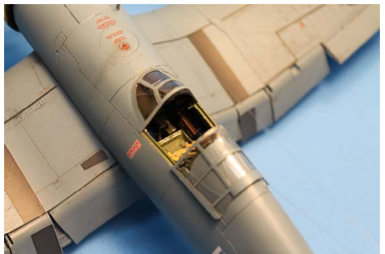
Rod Currier's 1/32 nd Tamiya F4U-1 "Birdcage" Corsair