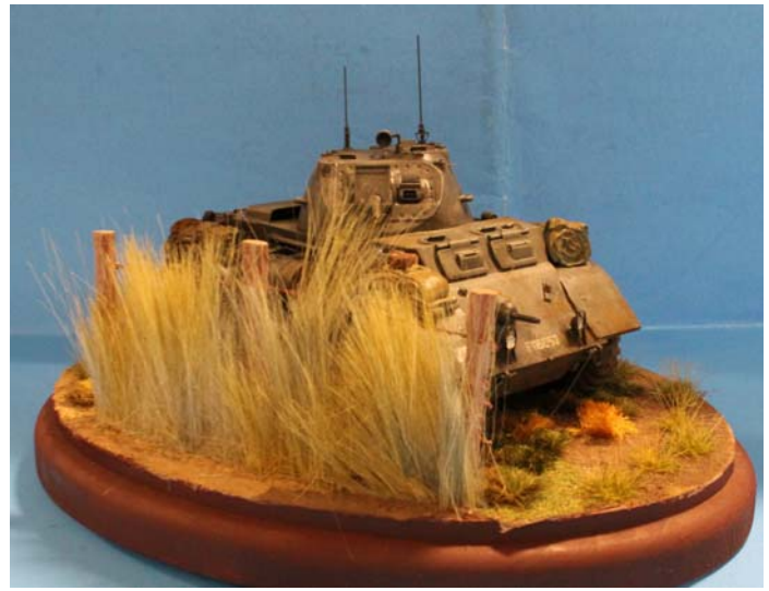
Keith Touchette's 1/35 th Bronco "Staghound" with Voyager PE and Blast Models storage