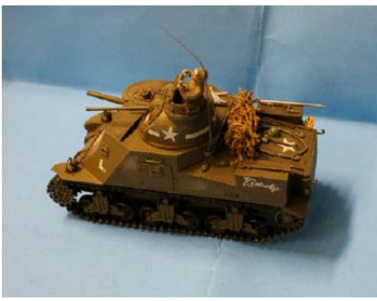
Chuck's Lee Tank