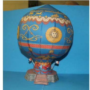
Dick's card stock Hot Air Balloon