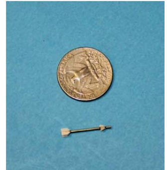
Ed Mele's Scratch 1/144 th AIM 9